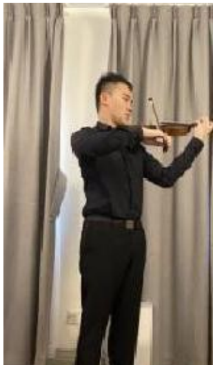
Stringed Instrument Performance