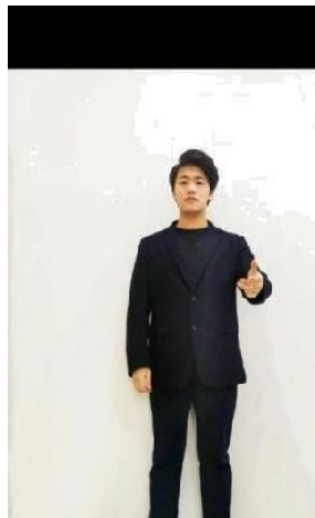
Example for Video Recording