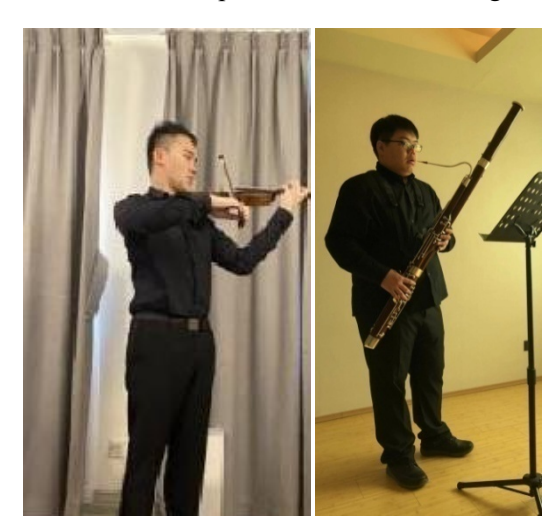
Stringed Instrument Performance Wind Instrument Performance

2) Q&A: Only the applicant is allowed to appear in the video; he/she should remain in the filming range with the camera fixed at one place to produce a continuous, fixed-angle recording. No post-editing is allowed.