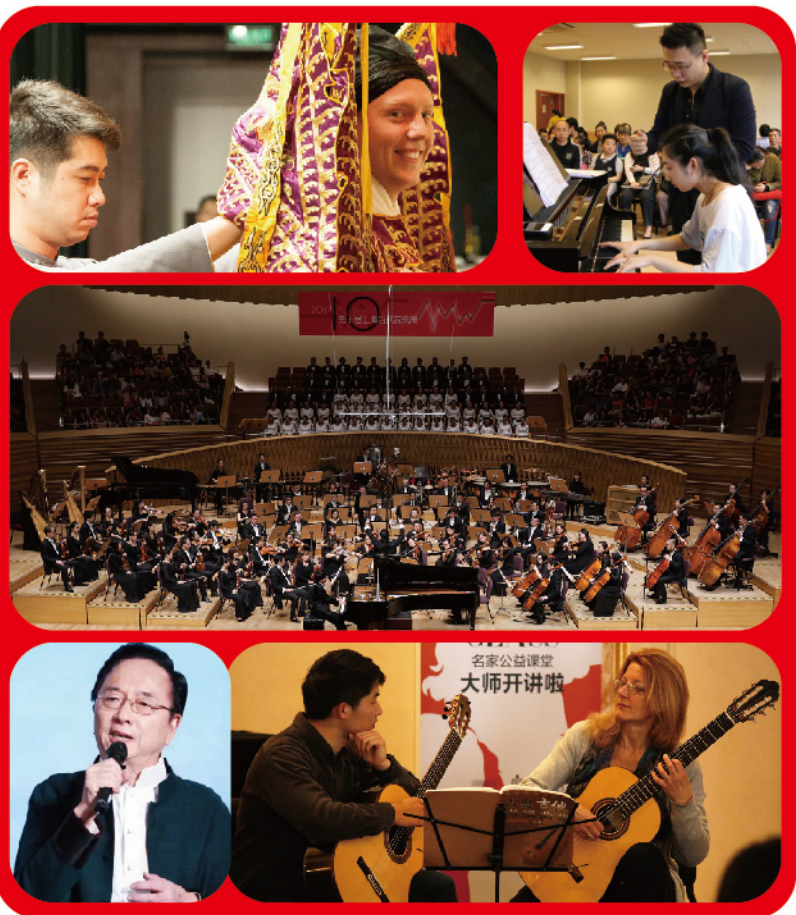
中国传统音乐研习所 上海当代音乐周 市民公益音乐课堂 “克勒门”文化沙龙 上音众乐星期音乐会 上音网络课堂

The Center carries out many public welfare projects such as "Public Music Classroom, Chinese Traditional Music Workshop", and "Shanghai Conservatory of Music Concert" (Weekly Concert), and cooperates with many enterprises to bring high quality music to the general public. At the same time, in line with the trend of "Internet +", we have established an art education information service platform.