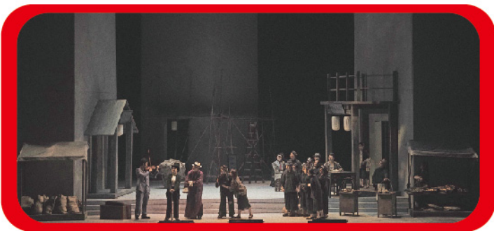
大型原创歌剧《贺绿汀》(2017-2018) Original opera "He Luting"

扫描二维码了解项目信息 SCAN QR CODE FOR PROJECT INFORMATION