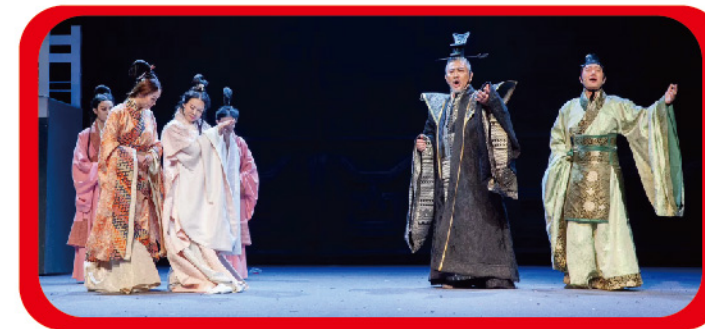
大型原创音乐剧《爱·文姬》 Cross-border integration musical "Love Wenji"