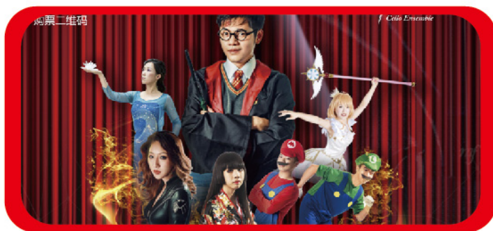
互动亲子音乐会：“玩趣”音乐会(2018) Interactive Parent-children Concert: "Concert for Fun"