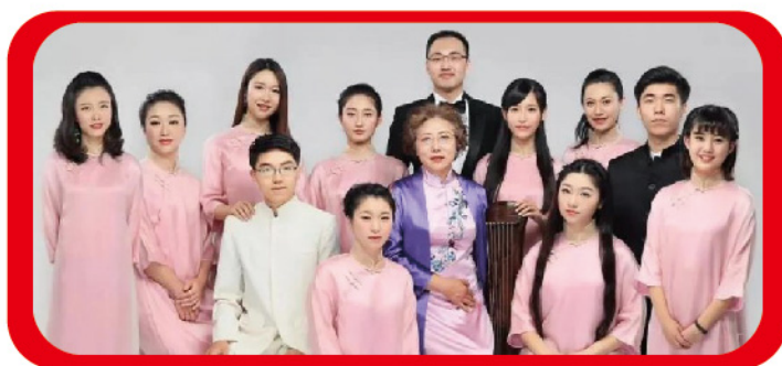
大型跨界融合音乐会《静听琴说》(2018) Cross-border integration concert "The Story of Music"