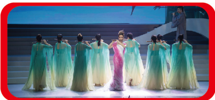
大型原创交响民族器乐剧《笛韵天籁》(2018) Original symphonic national instrumental performance "Heavenly Flute"