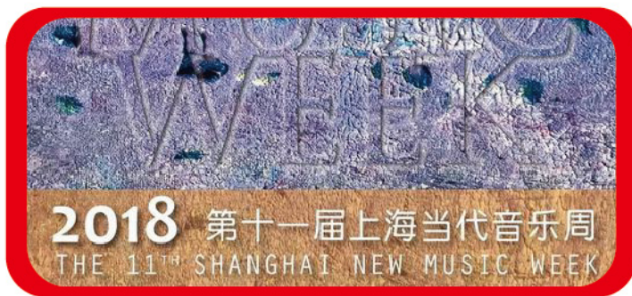
2018上海当代音乐周 2018 THE 11 TH SHANGHAI NEW MUSIC WEEK