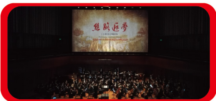
大型多媒体交响剧场《丝路追梦》(2016-2018) Multimedia Symphony Theater "Silk Road Dream"