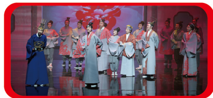
大型原创音乐剧《汤显祖》(2016-2018) Original musical "Tang Xianzu"