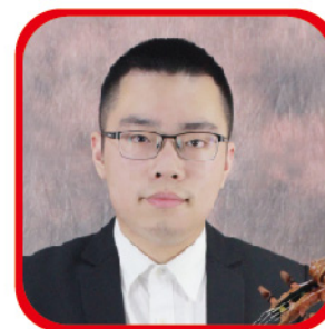
花卉 Hua Hui