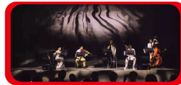
大型跨界融合音乐剧《东去西来》(2017-2018) Cross-border integration musical "The East and the West"